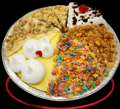
ALL FLAVORS PIE